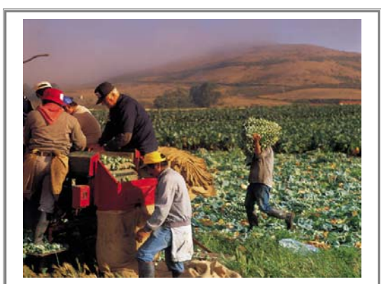
In addition to other benefits, worldwide agriculture benefits of better El Niño forecasts are at least $450 to $550 million per year

biosphere must be further explored, studied, and monitored to improve our understanding of fisheries productivity and our management of coastal resources.