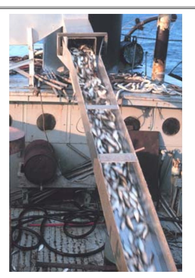
The commercial fishing industry adds approximately $28.5 billion in economic value to the national economy every year.

Ecosystems : Possibly our most under-appreciated challenge involves understanding ecosystems where human activity has a principal impact on their dynamics. NOAA has made dramatic strides in the ecosystems area: discovering new habitats (sea mounts, deep sea vents) and exciting new biota with unique chemistries, protecting marine mammals, regulating fish stocks, managing coastal habitats, and raising the awareness of oceans and coasts by the American public. However, we need to better understand the cumulative effects on natural systems of unprecedented human growth and development and to create effective means of mitigation so as to sustain ecosystem function. NOAA presently supports or conducts numerous ecosystem-based studies ranging from physical modeling to ecosystem characterization and habitat restoration. Our predictive capability, though, is limited, as is the degree of integration across disciplines. The forcing mechanisms and links between the physical environment and the