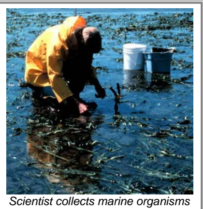
Scientist collects marine organisms at low tide at Padilla Bay National Estuarine Research Reserve.

• NOAA will continue to provide research products and information for collaborative use by the Private Sector.